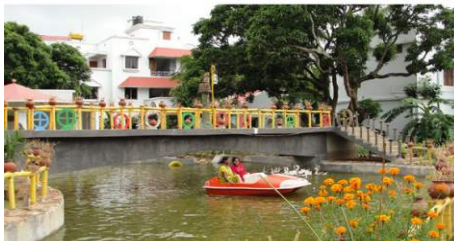
1st Module Venue: Siddharth Village, Jatni, Orissa