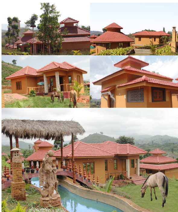
2nd Module Venue: Woodsong World Resorts Kakirigumma, Koraput, Orissa